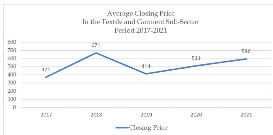
Figure 1. The average closing share price for the textile and garment sub-sector for the 2017-2021 period.